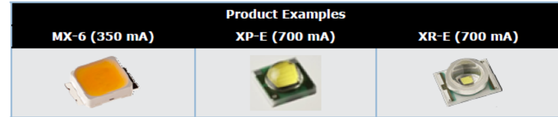
Cree LEDs Tested